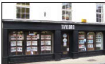
HUNTINGDON OFFICE 103 High Street